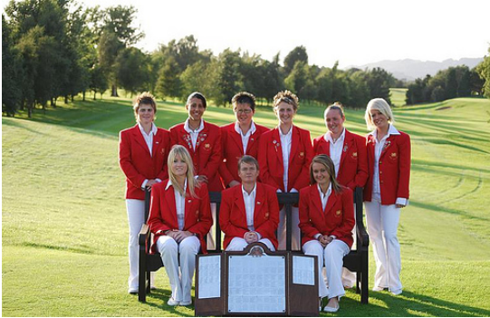
The victorious Welsh Ladies' Team at Wrexham

The European Team Championships were disappointing across the board with none of our teams contesting the top flights.