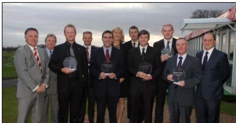
Winners of the Future Financial's Welsh Golf Awards 2012

The Future Financials Welsh Golf Awards were presented at a luncheon at the Celtic Manor Resort in December 2011. These awards would not be possible without the support from of sponsor Future Financials. 2011 was the second year they have sponsored the awards and they have already committed to 2012. Future Financials is a Cardiff based Welsh company which provides Golf Clubs with a facility that enables their members to pay their annual subscriptions by monthly direct debit payments, rather than in one large annual payment.